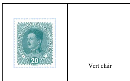
20 h 163 20 h 163a