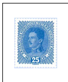
25 h 164