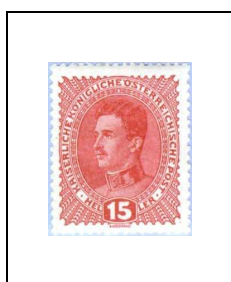
15 h 162