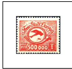
500000 m 17