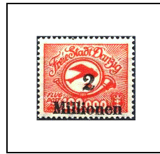
2 Mn s. 100000 m 18