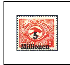
5 Mn s. 50000 m 19