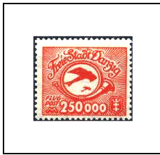
250000 m 16