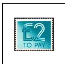
2 £ 96