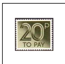
20 p 92