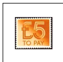
5 £ 97