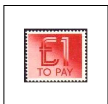
1 £ 95