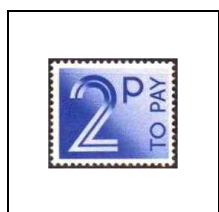
2 p 87