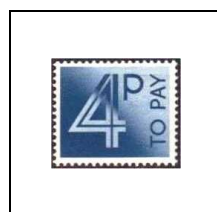
4 p 89