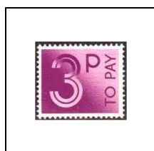
3 p 88