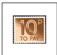
10 p 91