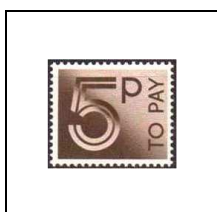
5 p 90