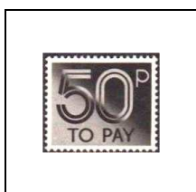
50 p 94