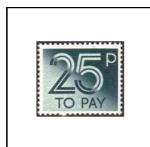
25 p 93