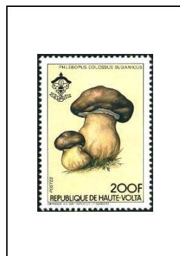
Phlebopus colossus sudanicus