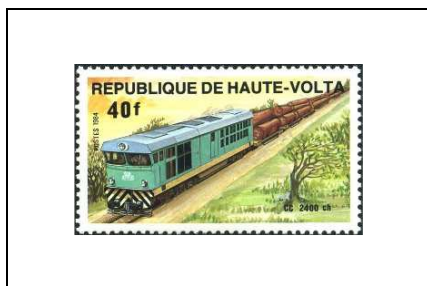
CC 2400 ch.