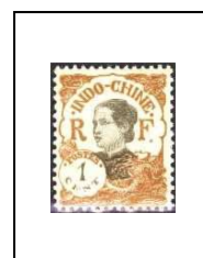
1 c 100