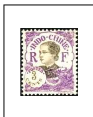
3 c 102