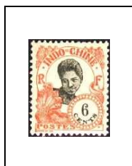
6 c 105