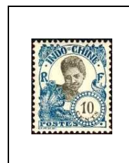
10 c 109