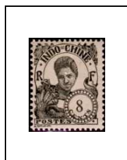
8 c 107