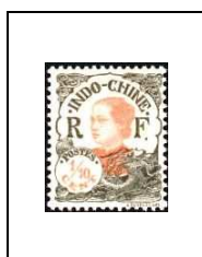
1/10 c 96