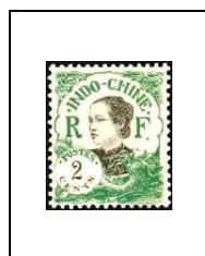
2 c 101