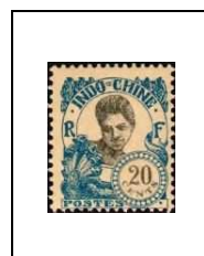
20 c 113