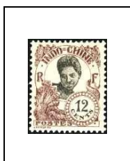
12 c 111