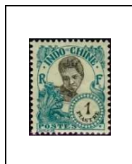
1 pi 115