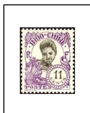
11 c 110