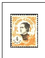
4 c 103