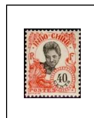
40 c 114