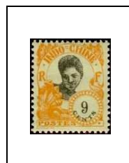
9 c 108