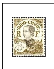
2/5 c 98