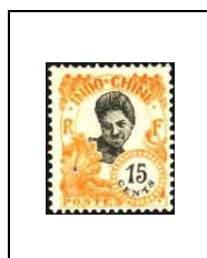
15 c 112