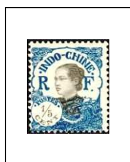
1/5 c 97