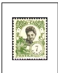
7 c 106