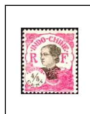
4/5 c 99