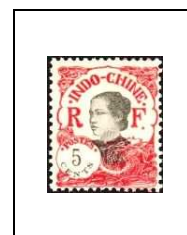
5 c 104