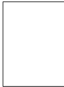
1 c 6A