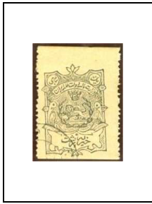
(1 c) 1