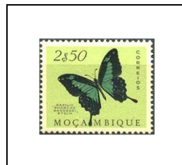
Papilio phorcas ansorgei