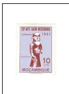
10 c 416

Exposition d'art missionnaire sacré, à Lisbonne