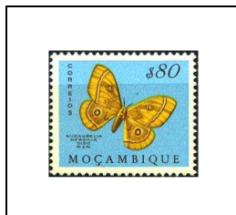
Nudaurelia hersilia dido