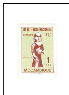
1 e 417