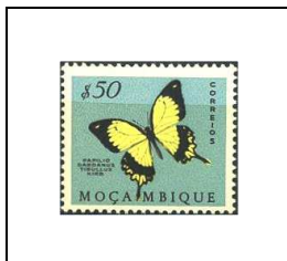
Papilio dardanus tibullus