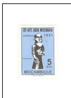
5 e 418