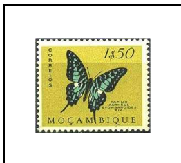
Papilio antheus cyombariodes