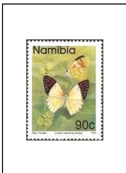
Colotis celimene phloe