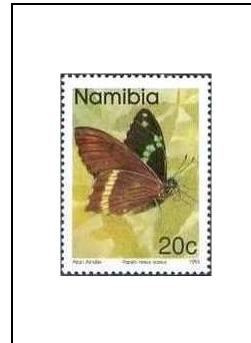
Papilio nireus lyaeus