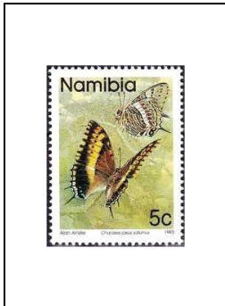
Charaxes jasius saturnus