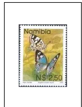
Stugeta bowkeri tearei