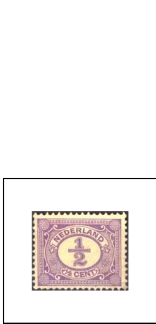
1/2 c 65