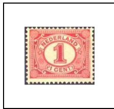
1 c 66