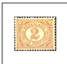
2 c 68