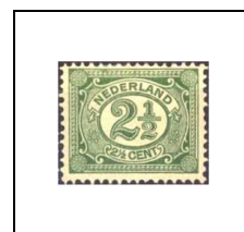
2 1/2 c 69