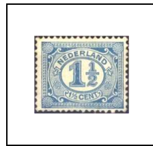
1 1/2 c 67